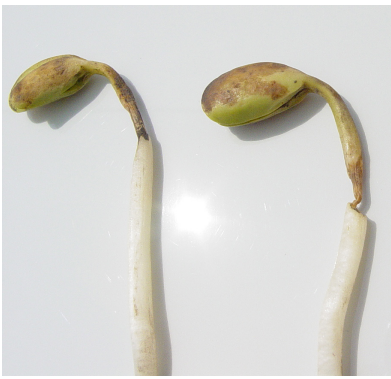
Soybean seedlings with damping off symptoms due to Pythium seedling blight.