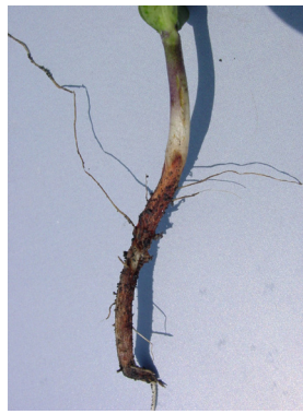
Symptoms of Rhizoctonia root rot. Note the red discoloration.