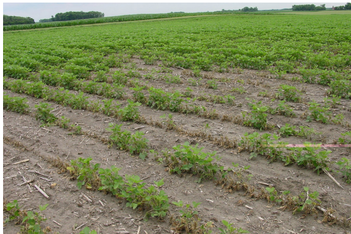
Soybean field showing stand reduction due to fusarium root rot.