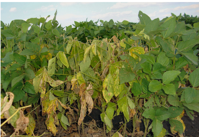
Soybean plants wilting due to Phytophthora root and stem rot.