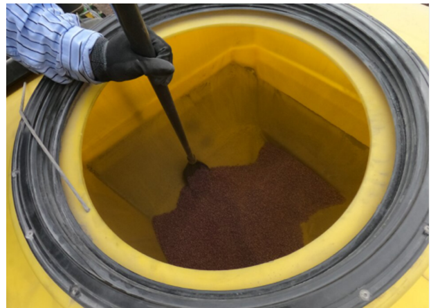
Image: Well-mixed treatment, mixing seed with scoop

When talc/graphite was poorly-mixed, percent singulation (skips and doubles) decreased, indicating a less accurate planting experience. However, when talc/graphite was well-mixed, percent singulation increased and no difference was observed between seed size or seed treatment. Large seed treated with the higher seed treatment load, when talc/graphite was well mixed delivered >98% singulation at 10 MPH and planting rate of 70k seeds per acre.