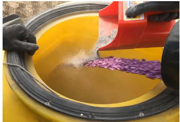
Image: Well-mixed treatment, adding planter aid to the hopper while seed is flowing.

For each test, seed treatment and seed size were the same with well-mixed planter aid in one center-fill bulk tank and partially mixed planter aid in the other bulk tank. The partially mixed planter aid treatment followed the suggested label rate also, but was not mixed with the seed. The well-applied planter aid followed the label by adding a scoop to the bottom of the hopper, then planter aid was added to seed flowing into the hopper and thoroughly mixed with a John Deere AA99640 Scoop throughout the fill.