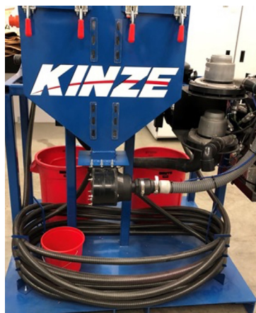
Image: This bulk fill test stand was developed by Kinze Manufacturing to replicate their air seed delivery system. The system includes a small, bulk fill chamber, entrainer, seed delivery tubing (length equivalent to a 24-row planter) and two individual vacuum meters.